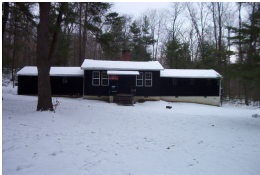
Cabin in the snow