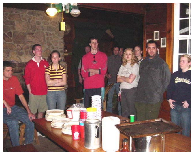
Actives, Alumni, and Guests Gather Around the Table Before the Serving of the Senior Dinner