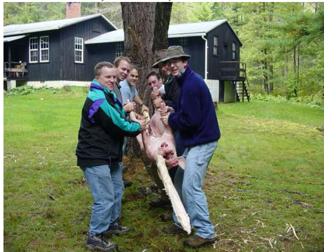
Actives and Alumni Skewing the Pig: October 4, 2003