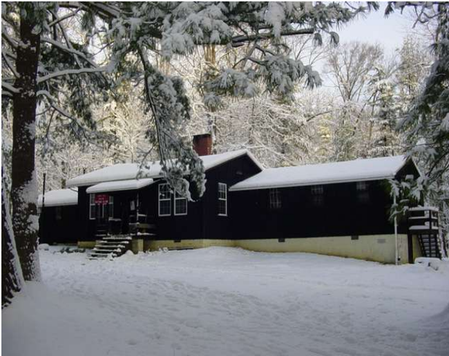
The Cabin After the Snowstorm at the Christmas Party