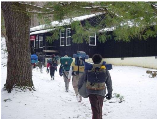
The fearless campers returning to the cabin after braving a camping adventure in the bitter cold.