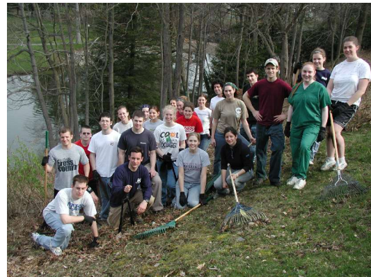
The Club taking a break from their hard work at the hill clean-up