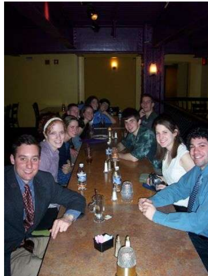
The club entertaining themselves at the jazz club.