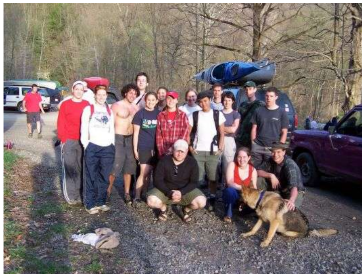
Alumni-Active Alleghany Canoe Trip April 2004