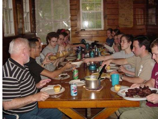
The annual senior dinner at the cabin...we should really add food to the "friendship, fellowship, fun" motto.