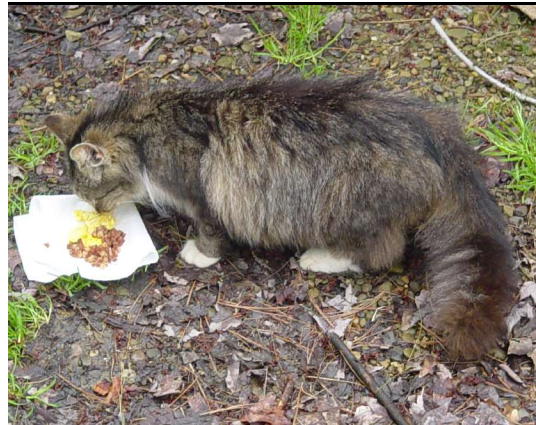
KK (the Kabin Kat)-the Cabin recently "acquired" a pregnant cat, or perhaps it would be more appropriate to say she acquired us. Either way she lives in the basement and is very friendly and very hungry.