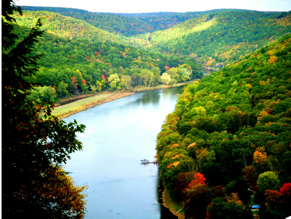
(A View of the Allegheny River from the Overlook)

Lee McCoy 992 Slippery Rock Road Grove City, PA 16127-9889 ADDRESS CORRECTION REQUESTED