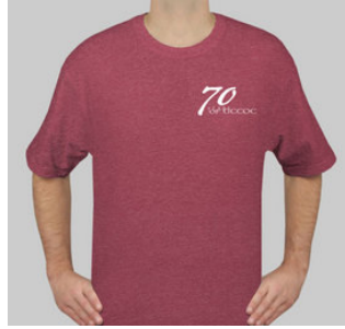
Front: "70 years of GCCOC" (shown in Cardinal Heather)

All Proceeds from Anniversary t-shirt sales goes to the cabin Fund