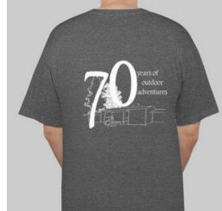
Back: "70 years of Outdoor Adventures" (shown in Gray Heather)

To pre-order a shirt to pick up at homecoming or to have one sent to you, fill out the order form below: