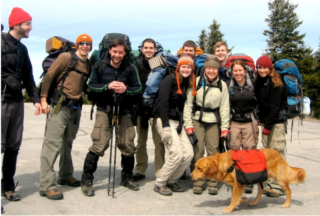
(Spruce Knob hiking group)